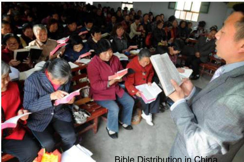
Bible Distribution in China

The Bible Society goes about its business, promoting the availability, accessibility and credibility of the Scriptures in England and Wales and right around the world.