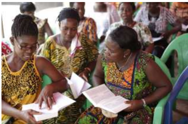
At an Alpha Course in Ghana

The Society continues to work on translating the Bible into more of the approximately 7,500 languages in the world (including some 500 sign languages). Bible Societies around the world are already responsible for more than 325 of the 542 complete translations but the users of more than 4,000 languages still wait for even one portion of Scripture to be translated.